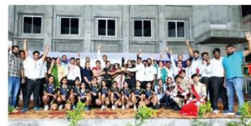
2 nd Position (Girls) CBSE Basketball Cluster