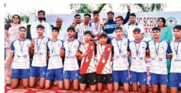
2 nd Position CBSE Volleyball Cluster