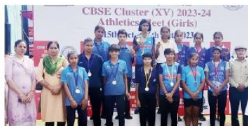
1 st Position CBSE Cluster XV Athletics